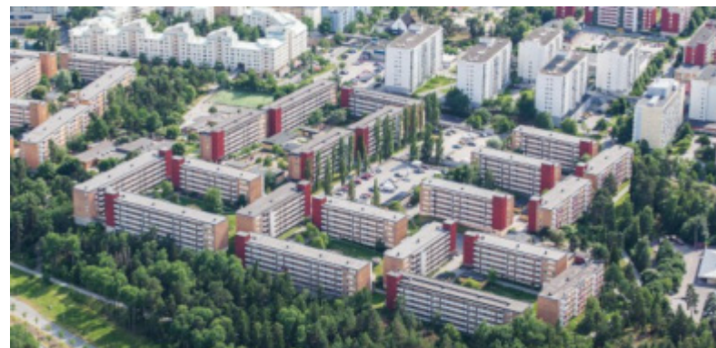
The Swedish real estate space rebounded during the quarter and D Carnegie was one of the top performers in Q3.